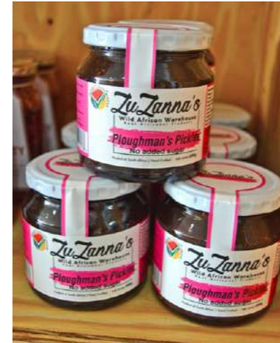
Locally sourced craft pickles