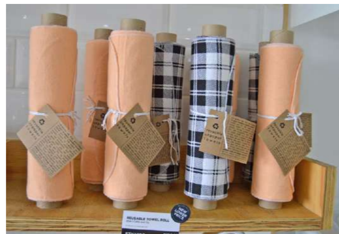
Reusable roller towels