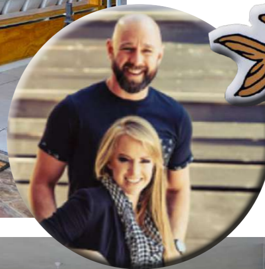
The Refillery store owners