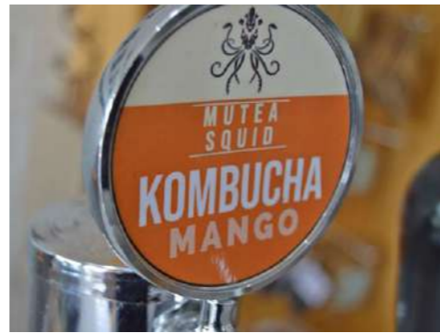
Mutea Squid Kombucha Mango on tap