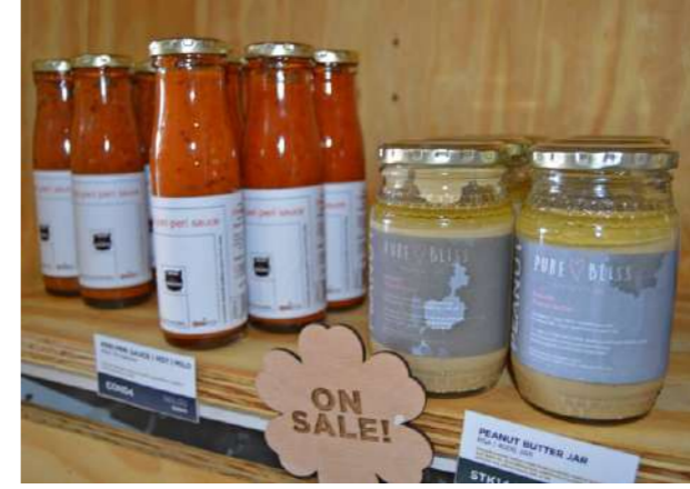
Locally manufactured peanut butter and peri-peri sauce