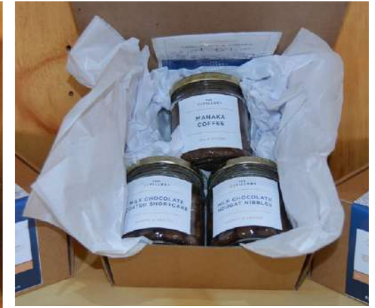
Beautiful gift boxes for corporate functions or birthdays