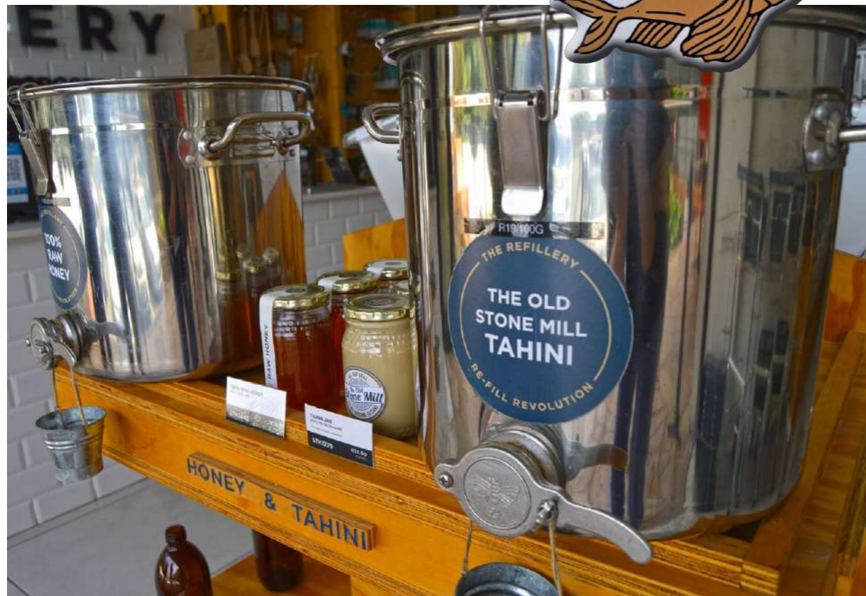
Raw honey and Tahini on tap