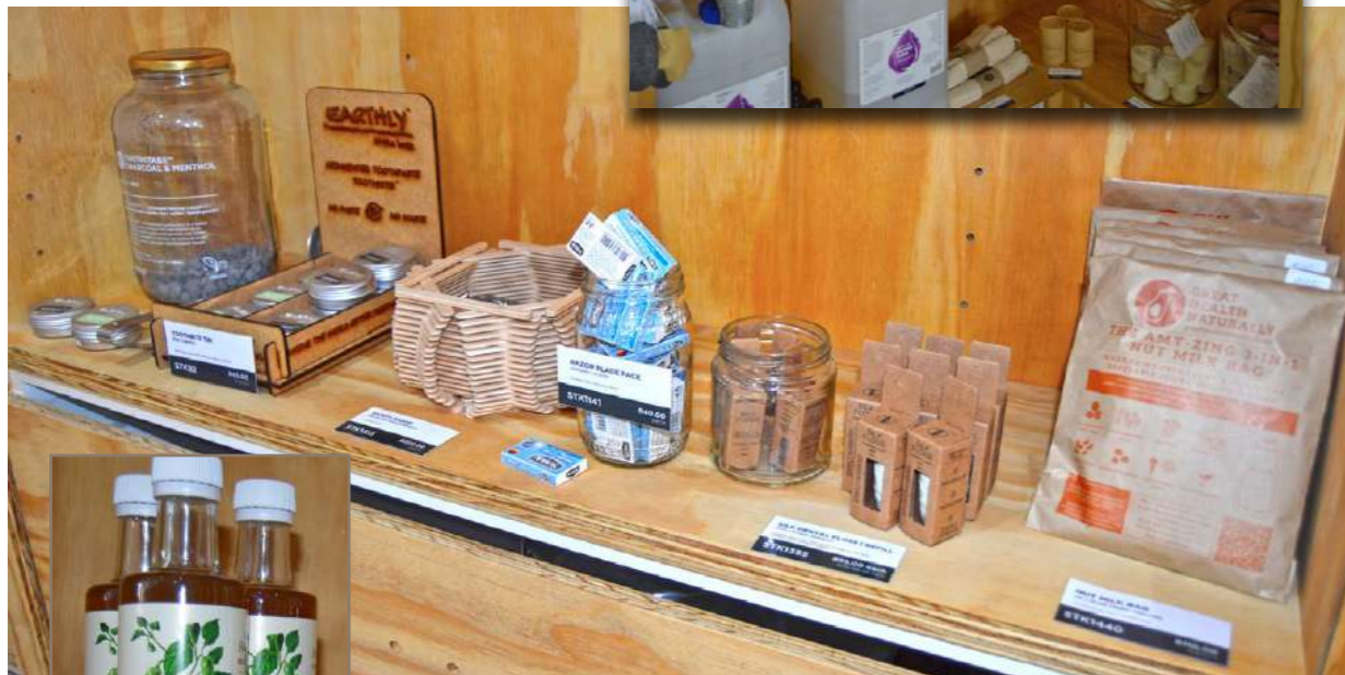
Personal care items