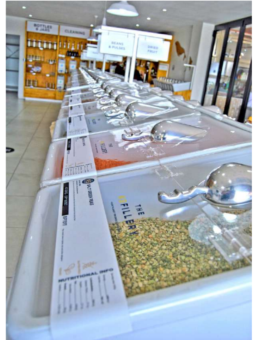
Dry grocery items stocked