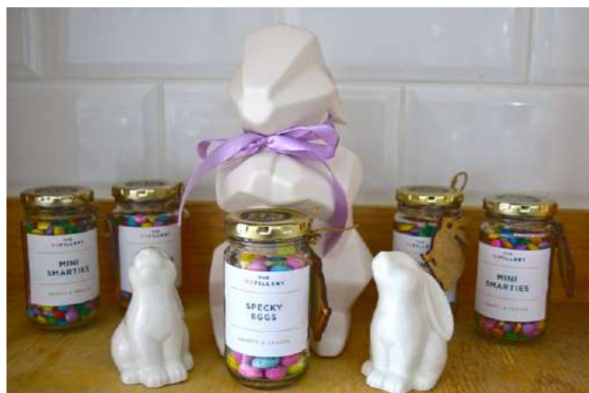
Cute Easter product display