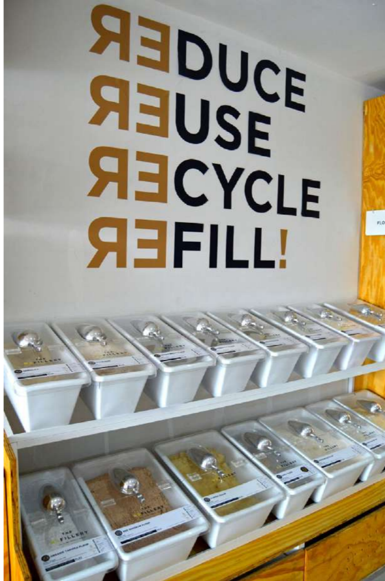
Containers stacked with products, allowing you take as much as you need.