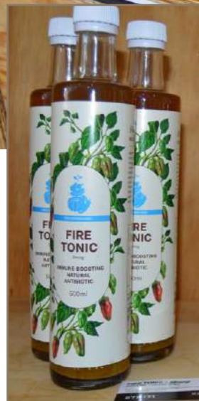
Fire tonic and Kombucha vinegar