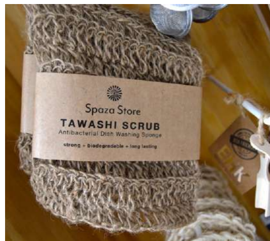
Antibacterial biodegradable scrub