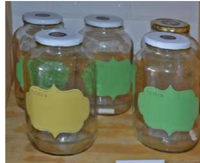
Glass jars for bulk purchases