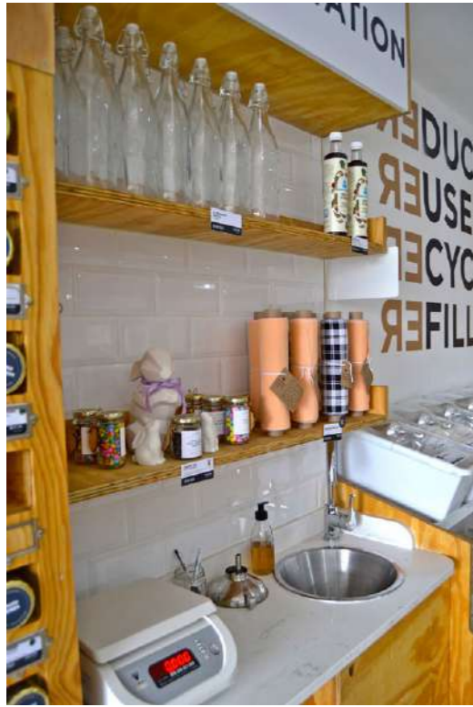
Weigh station for ease of shopping Wide range of herbs and spices