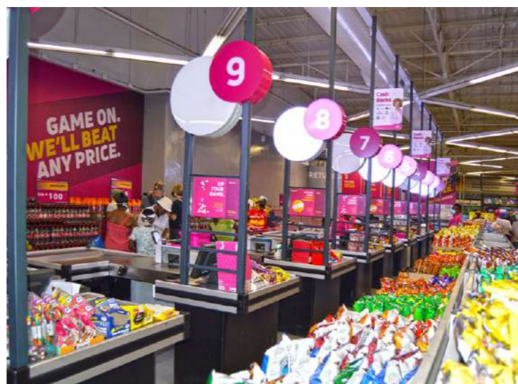
Checkout counters and cashiers ready to assist you