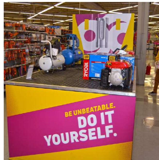
Extensive range of DIY equipment