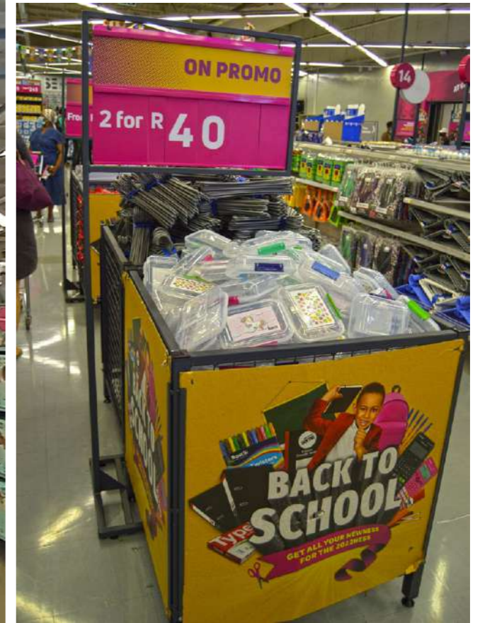
In-store bins filled with deals