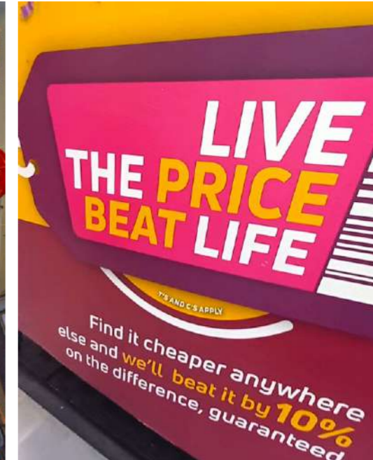
Game famous price beat module