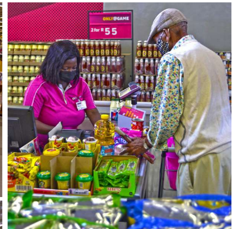
Helpful staff waiting to assist you