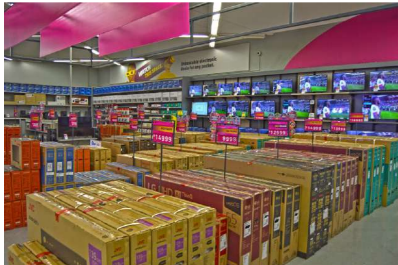
Wide range of electronic goods and appliances