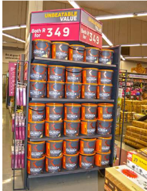
Supplements and wellness products for the health conscious consumers

Back to wellness is a focus area for Game