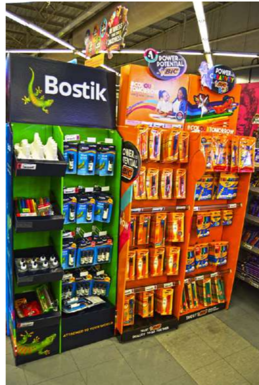
Bulk stationery and books are available