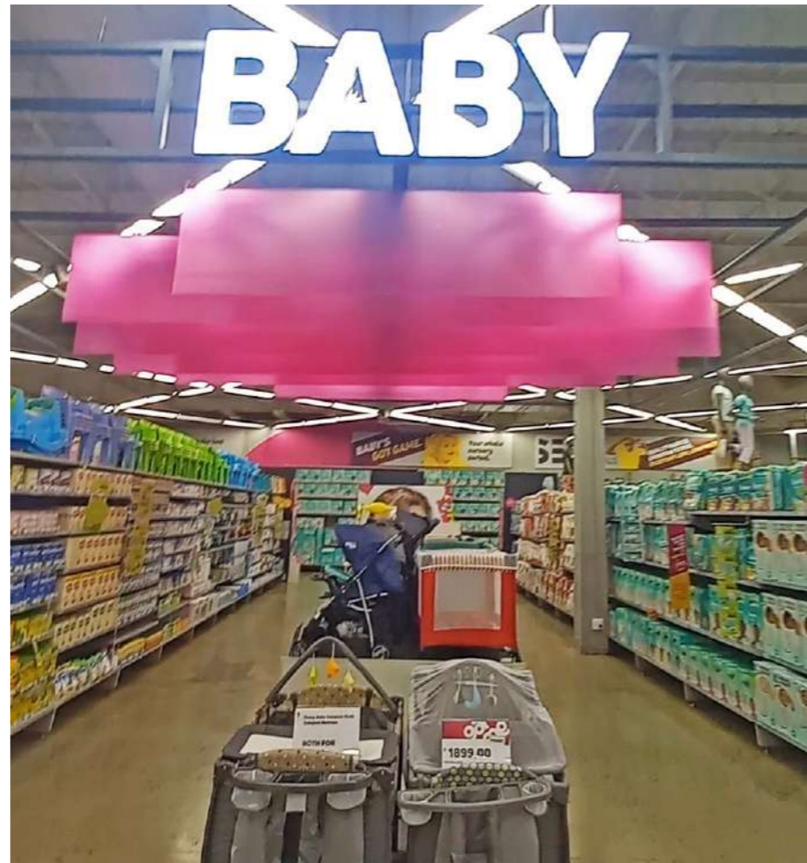
Baby department filled essential baby goods

Follow Game online to stay up to date with current specials visit www.game.co.za