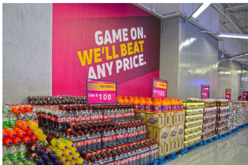
Grocery items available in bulk