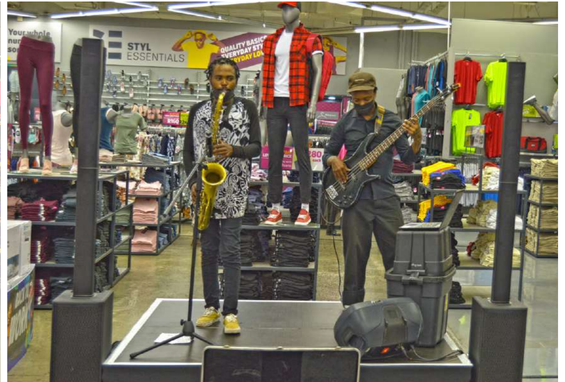
Opening day in-store entertainment