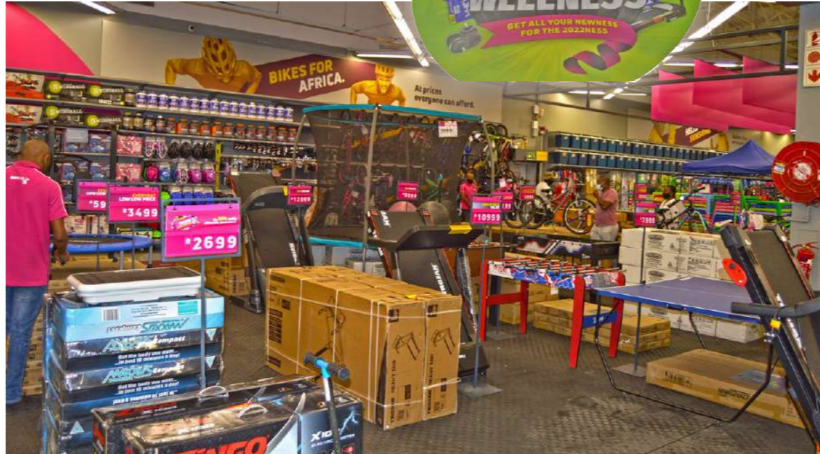
Sporting goods to keep you fit and healthy