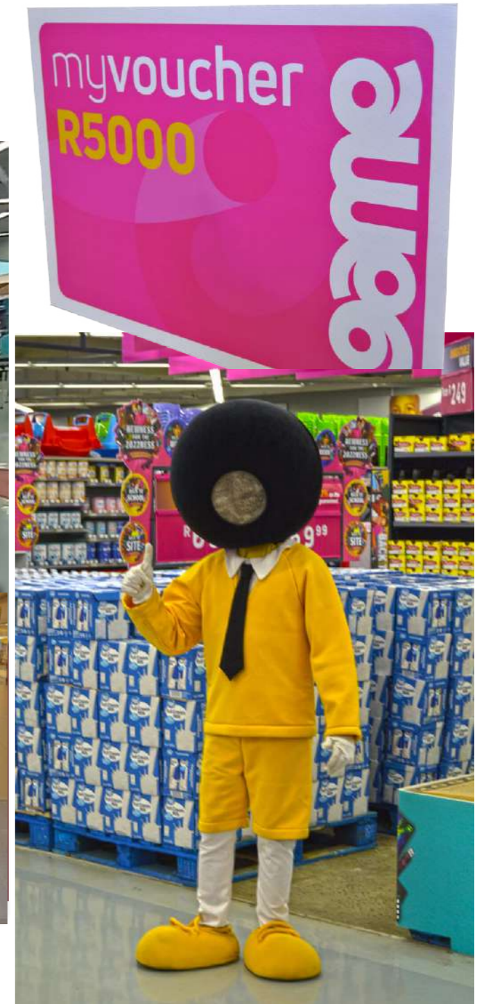
Right: BIC Mascot welcoming shoppers to the store.

In July 2021 the South African retail sector was hit with a devastating wave of unrest. Game stores had a total of 10 outlets damaged beyond recognition. Many stores were left an empty shell. Being known for providing customers with unbeatable prices, the group has come out stronger than ever with their 'Retail Reimagined' concept.